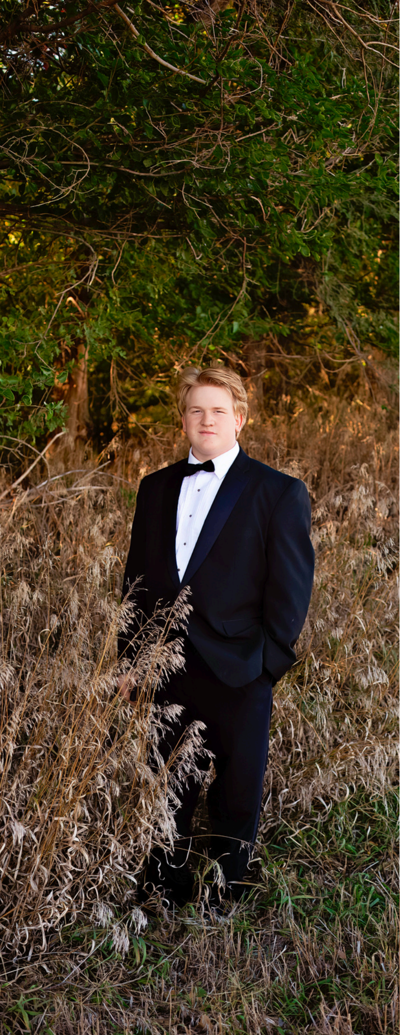
PHOTO DELIVERY TIMELINE